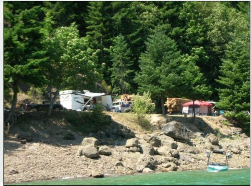
Quartzville Corridor at Green Peter Lake